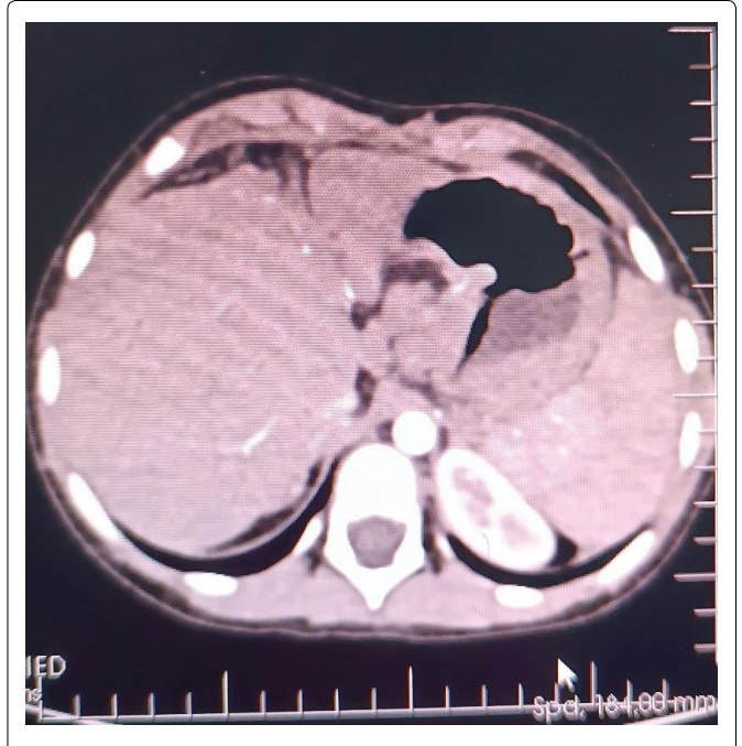
Figure 1: In the patient's liver computed tomography (CT) - angiography, diffuse hepatoportal shunt and splenomegaly were found in the liver parenchyma due to the operated biliary atresia.

Standard monitoring was applied to the patient, including ECG, SpO<sub>2</sub>, noninvasive blood pressure, capnography, temperature and bispectral index. After preoxygenation with 80% O<sub>2</sub> for 3 minutes, induction was performed with lidocaine 1 mg/kg, propofol 2-3 mg/kg, fentanyl 1 \mu g/kg and rocuronium 0.6 mg/kg and with a number 4.5 cuffed endotracheal tube without difficulty. The patient was intubated without complication and was connected to the ventilator. The patient's ventilator parameters were adjusted appropriately. After induction, a left radial artery catheter for hemodynamic monitoring and a left femoral artery catheter for PiCCO monitoring and a right subclavian central venous catheter was placed. Anesthesia was maintained with 0.01-0.05 µg/kg/min remifentanil infusion, 0.3 mg/ kg/h rocuronium infusion, 2% sevoflurane and 50% oxygen + 50% air mixture. In the intraoperative period, norepinephrine infusion (0.01-0.15 mg/kg/min) was started for hypotension.